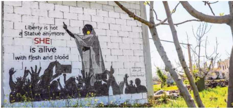
Powerful reminder: A painting of Alaa Salah, a Sudanese woman propelled to Internet fame after clips went viral of her leading protest chants against former President Omar al-Bashir.

Protest organisers had earlier on Saturday urged people to keep marching to demand a civilian government after the Defence Minister and the intelligence chief