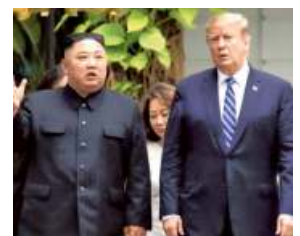
Kim Jong-un with Donald Trump, in this file photo.

His speech came hours after Mr. Trump and visiting South Korean President Moon Jae-in met in Washington and agreed on the importance of nuclear talks with North Korea.