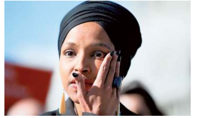
Point of view: Minnesota Representative Ilhan Omar.

and some Republican officials have focused on the words "some people did something," arguing that Ms. Omar was playing down the attacks that killed more than 3,000 people and led to two wars. The video the President tweeted also focused on those four words from Ms. Omar's speech.