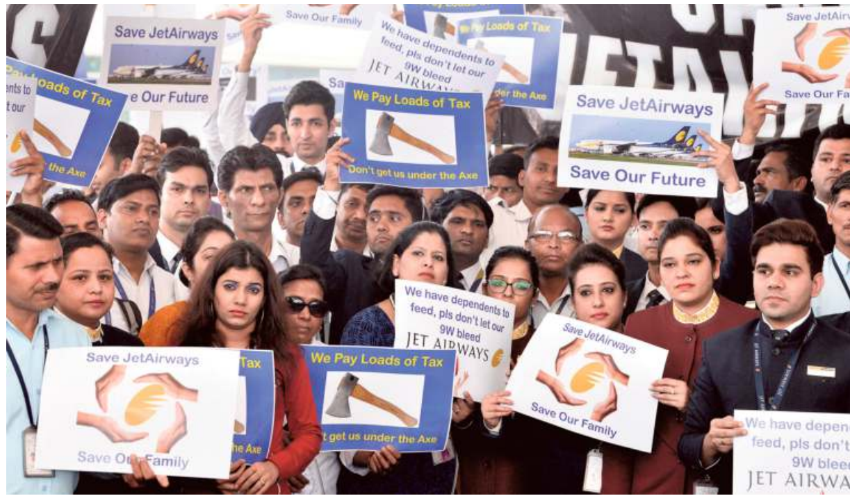
United effort: Jet Airways employees staging a protest seeking the revival of the airline, at the Indira Gandhi International Airport in New Delhi on Saturday.