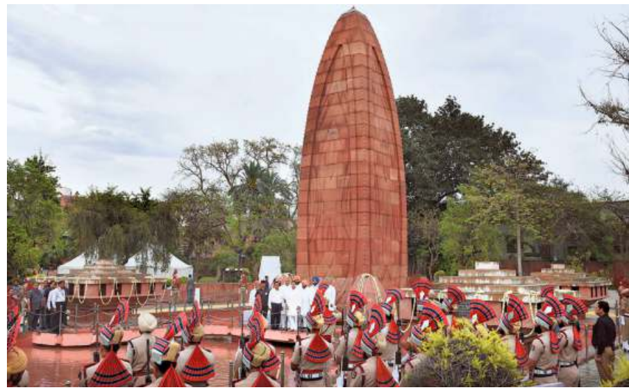
100 years later: People paying homage to commemorate the centenary of the Jallianwala Bagh massacre, in Amritsar on Saturday.