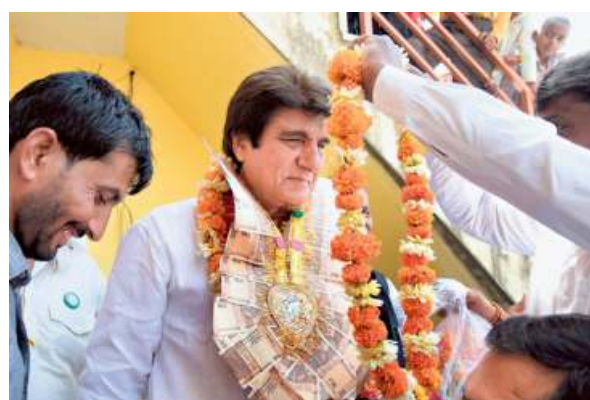
With the voters: Raj Babbar, Congress candidate from Fatehpur Sikri, at Choto Ikhtara in Agra Rural.