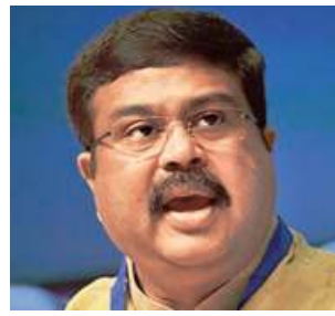
People will give a befitting reply to Naveen Patnaik in these polls