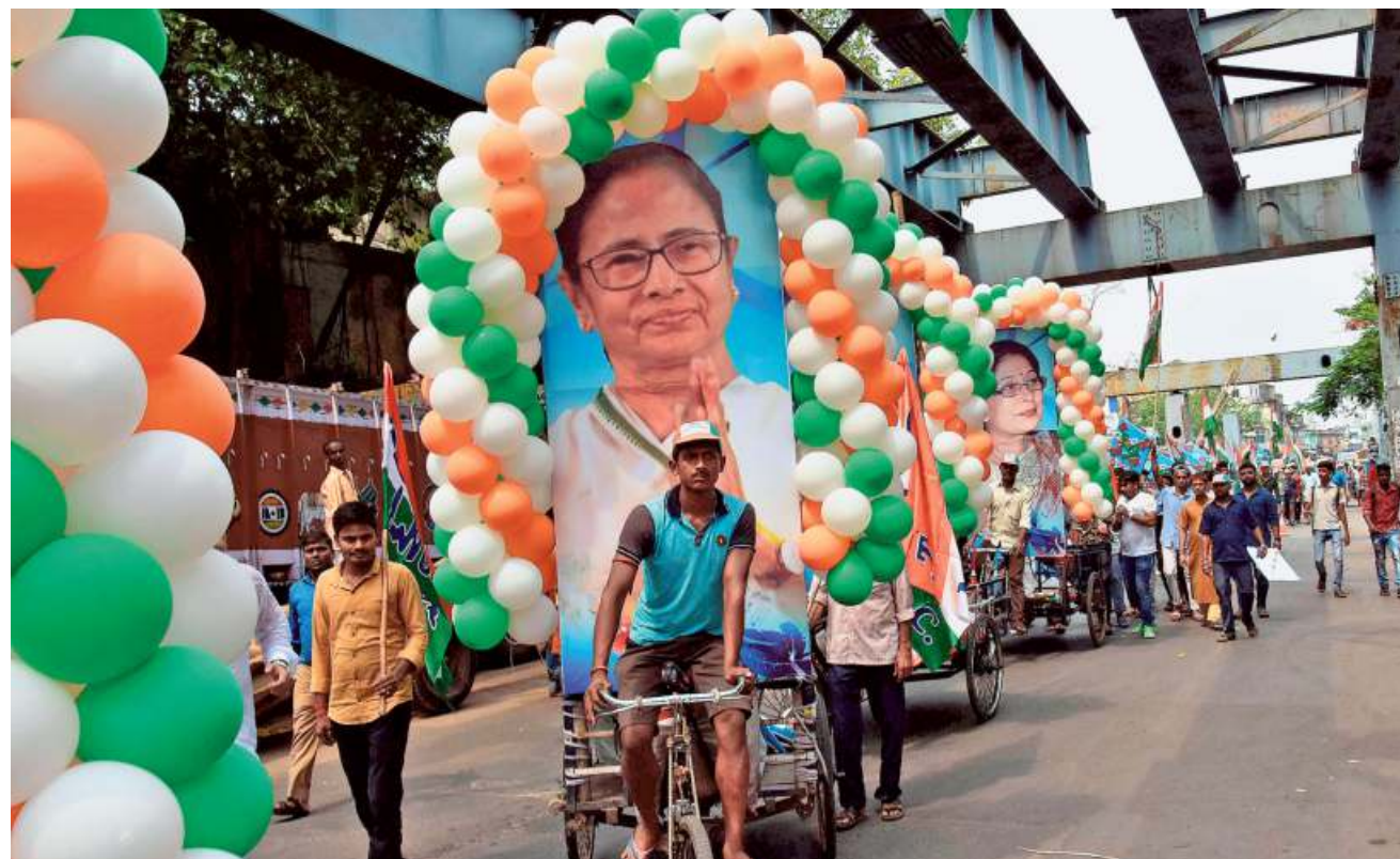
On wheels: A campaign on cycle rickshaws in Kolkata on Tuesday.