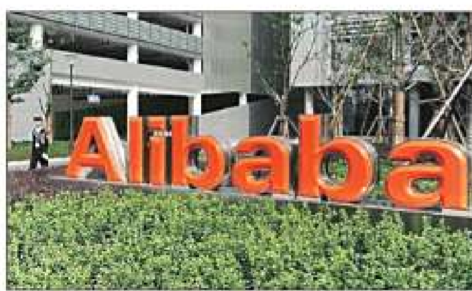
Jack Ma said working overtime could be a big blessing

This introspection in China comes in the backdrop of a similar debate in Europe, which is pushing for a four-day week,