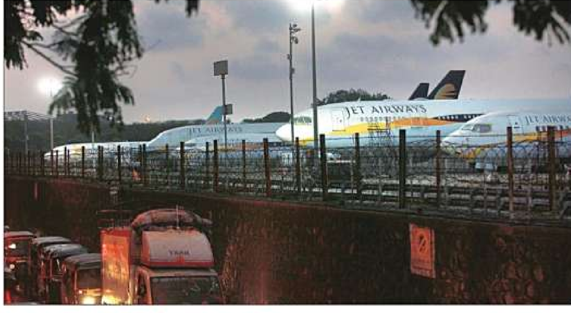
Jet Airways aircraft at the Chhatrapati Shivaji Maharaj International Airport in Mumbai on Tuesday.

Referring to the BJP, he said that on one hand, jawns are protecting the country and in tribal and backward areas his government had worked to prove roads, railway lines, mobile... CONTINUED ON PAGE 2