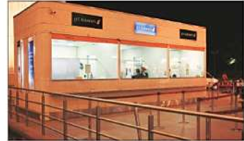
The deserted Jet Airways counter at the Chhatrapati Shivaji Maharaj airport in Mumbai Wednesday. Pradip Das

Consortium of banks led by SBI rejects emergency funding of Rs 983 crore