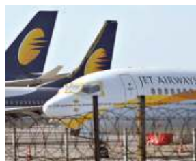
Lenders said they were unable to consider the request for interim funding.

In a filing before the Bombay Stock Exchange (BSE) and a statement to the media, the airline said it was informed by the State Bank of India (SBI), on behalf of the consortium of Indian lenders, that they were unable to consider its request for critical interim funding.