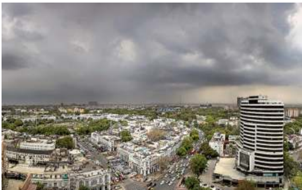
Cooler capital: Rain clouds gather over New Delhi on Wednesday, promising relief from the summer heat.

Prime Minister Narendra Modi took to Twitter in the morning to express anguish over the loss of lives in Gujarat and to announce relief.