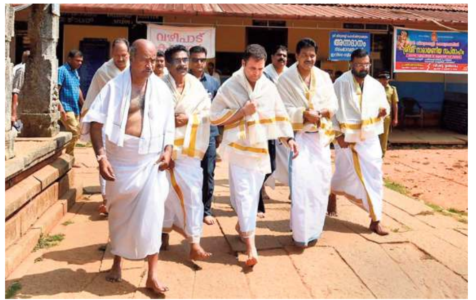
Hectic pace: Congress president Rahul Gandhi visiting the Thirunelli temple in Wayanad district of Kerala on Wednesday.

"I'm not confirming or denying anything. I'm just say-