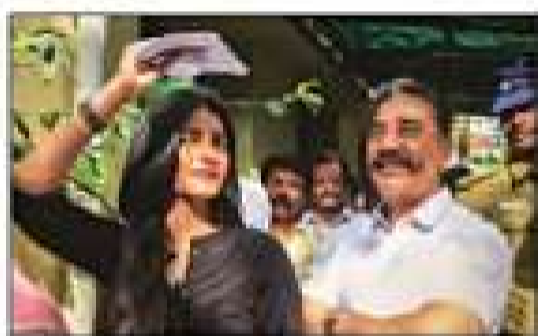
MKM chief Kamal Haasan with daughter Shruti in Chennai.