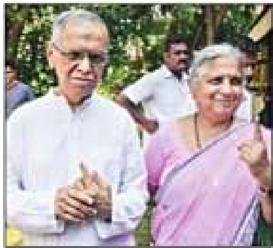
Infosys co-founder Narayana Murthy and his wife Sudha after casting votes, in Bengaluru on Thursday.