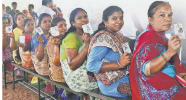
Woman power: Voters awaiting their turn outside a booth in the Karur Lok Sabha constituency on Thursday.

West Bengal, Assam, Manipur and Puducherry recorded the highest polling percentage on Thursday, while Jammu & Kashmir registered the lowest