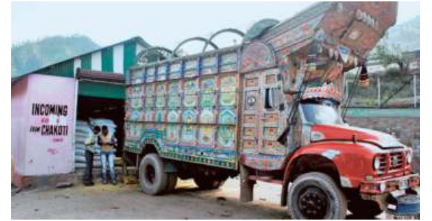
The decision will impact 300 traders and more than 1,200 people.

'Routes being used to move fake currency'