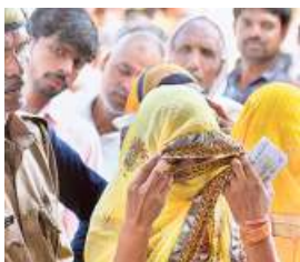
Voters at a booth at Diwana Kalan village of the Mathura constituency on Thursday.

Part of phase two of the poll process, Mathura saw a fight between incumbent actor-turned-BJP leader Hema Malini and Rashtriya Lok Dal-Bahujan Samaj Party-Sa-