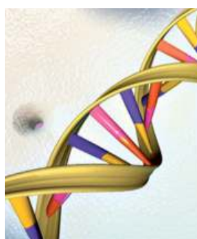
Many countries have studied genetic traits of citizens using sequencing.

Globally, many countries have undertaken genome sequencing of a sample of their citizens to determine unique genetic traits, susceptibility (and resilience) to disease. This is the first time