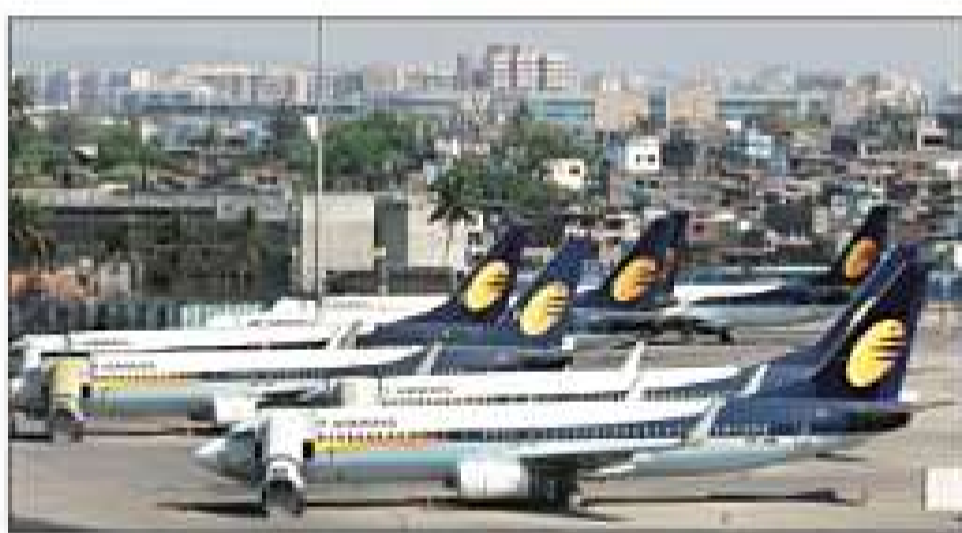
Jet temporarily suspended operations on Wednesday

MUKESH AMBANI-promoted Reliance Industries Ltd is learnt to have evinced interest in a stake in the beleaguered Jet Airways and, simultaneously, exploring the possibility of buying out the debt-ridden national carrier Air India, two sources close to the development told The Indian Express .