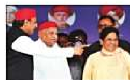
Mulayam, Akhilesh and Mayawati in Mainpuri.

PUTTING A quarter century of rivalry behind to counter the BJP in Uttar Pradesh, BSP chief Mayawati took to the stage Friday with SP founder Mulayam Singh Yadav in his Mainpuri bastion. Mulayam, also the gathbandhan candidate, asked his supporters to always "respect Mayawati" while she called him a "real leader" of the back-