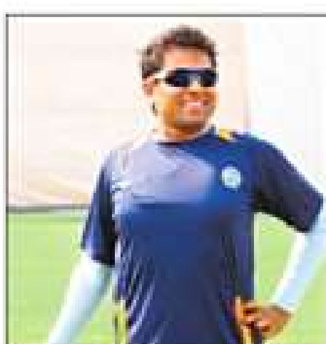
Aakash Chopra: 'How do you draw a line?'

The company manages top players like India captain Virat Kohli, World Cuppers K L Rahul and Kuldeep Yadav, international Umesh Yadav and Rishabh Pant, and promising prospects Shreyas Iyer and Ishan Kishen. But at the same time, it is also associated with the men who comment on the IPL performances of these players — former cricketers Aakash Chopra, Graeme Smith, Alan Wilkins, Mel Jones and Mpumelelo 'Pommie' Mbangwa. So far so good. Or may be not.