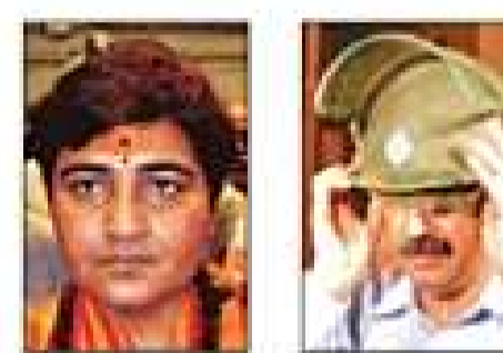
Maine kaha tera sarvanash hoga: Thakur on Karkare

PRAGYA SINGH Thakur, BJP Lok Sabha candidate from Bhopal, triggered a firestorm Friday saying Maharashtra ATS chief Hemant Karkare, killed in the line of duty during the 26/11 Mumbai terror attack, died because she had cursed him "tera sarvanash hoga". After her remarks drew all-round condemnation and the BJP distanced itself saying it was her "personal statement" and that Karkare was a "martyr", she retracted the remarks. "I felt that the enemies of the country were being benefited... therefore, I take back my statement and apologise for it. It was my personal pain," she told ANI. "They have started legal action saying I don't have the right to contest election and my bail should be cancelled. The only solace is they have not demanded that I be hanged... even if I am in jail, I will win," she said.