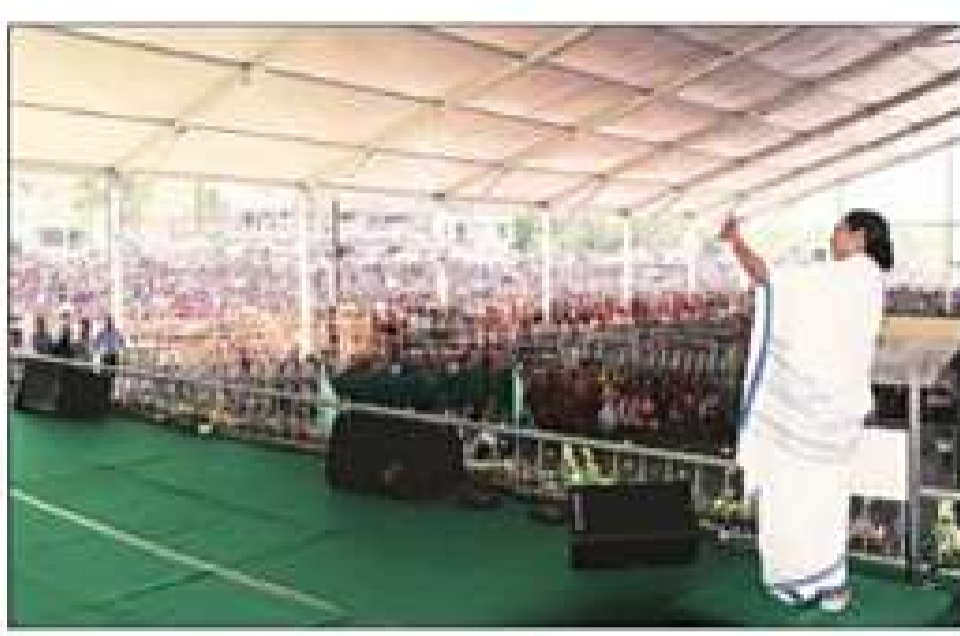
Mamata Banerjee addresses a rally in Panighata, West Bengal, on Saturday.

This time, however, the institution has a compass: the Gender Sensitisation and Internal Complaints Committee (GSICC) of the court, headed by Justice Indu