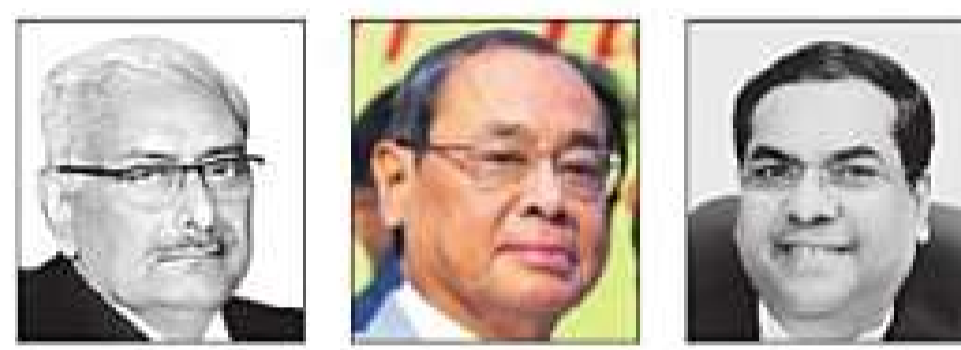
On the bench Saturday (from left) Justice Arun Mishra, CJI Ranjan Gogoi, and Justice Sanjiv Khanna.

'Two offices — one of PM, CJI. Those behind allegation want to deactivate office of CJI,' says Justice Gogoi