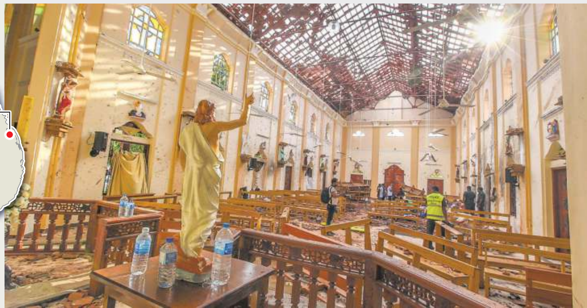
Broken calm: A view of the St. Sebastian's Church in Negombo, north of Colombo, which was damaged in a blast on Sunday.

the suspects or the alleged perpetrators.