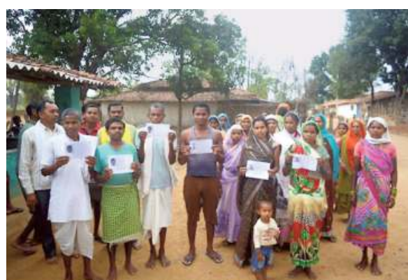
Boycott call: People of Fatehpur staging a protest.