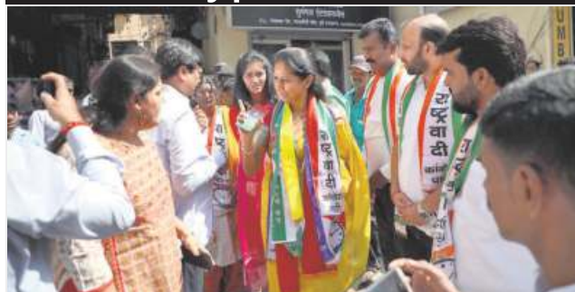
Supriya Sule, the NCP candidate from Baramati seat, interacts with her supporters.

Assembly segments under Baramati: Daund, Indapur, Baramati, Purandar, Bhor, Khadakwasla