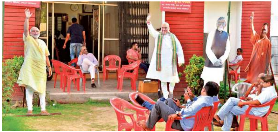
Back to the wall: The scene at the election campaign office of veteran BJP leader Santosh Kumar Gangwar in Bareilly.

With that message, the Union Minister is looking for his eighth term as MP. But this