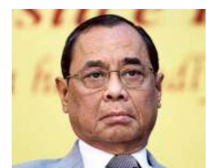
CJI Ranjan Gogoi

The Bench was convened at short notice after online news portals published allegations levelled by a woman against the CJI. The hearing sparked a public debate on whether the CJI was sitting