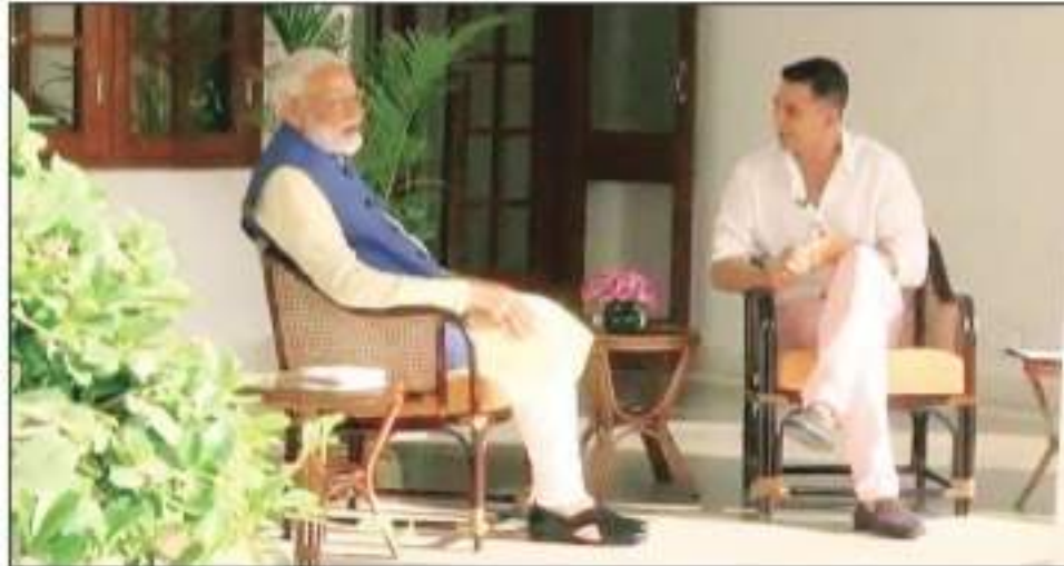
A video grab of the interaction between actor Akshay Kumar and Prime Minister Narendra Modi.

Apparently replying to Modi's remarks on gifts he gets from her, Banerjee said at a rally in Srerampore, Hooghly district, without naming the Prime Minister: "It is Bengal's culture to welcome guests with sweets and tea. We also greet them on special occasions. This is our tradition. We welcome guests with sweets and gifts, but they (BJP)