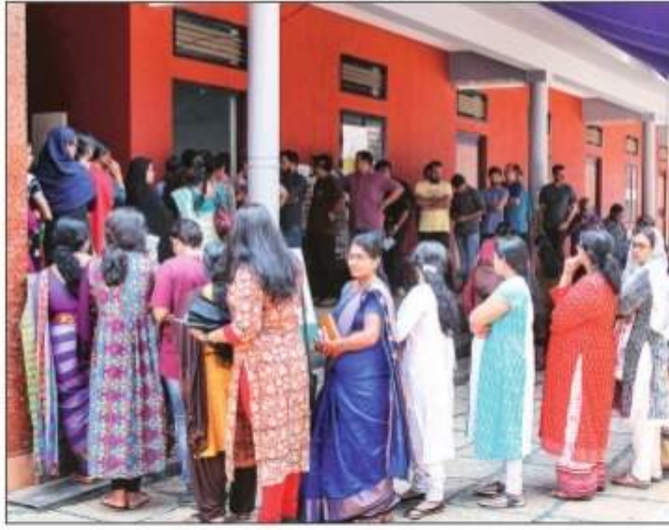
Women wait in queue to cast their votes at a polling station in Kozhikode on Tuesday.

This year, eight constituencies have registered more than 80 per cent polling, and only six recorded polling below 75 per cent. While four seats saw less than 70 per cent voting in 2014, all 20 went past that mark this time.