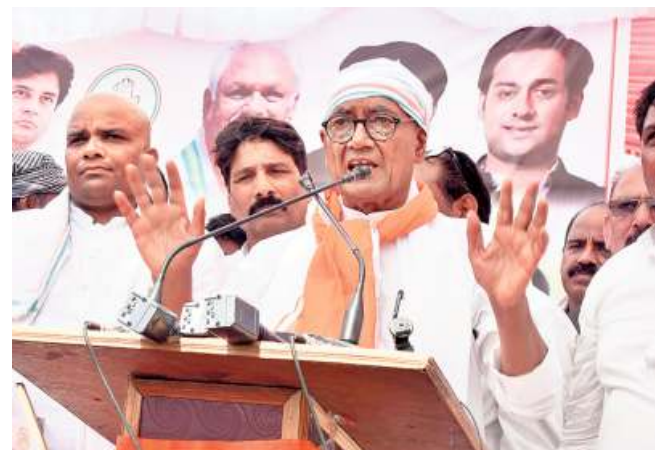
Bristling battle: Congress candidate Digvijaya Singh addressing a public meeting at Suraj Nagar, and BJP candidate Pragya Singh Thakur going on a roadshow at Jawahar Chowk.

When informed that the BJP candidate remains an ac-