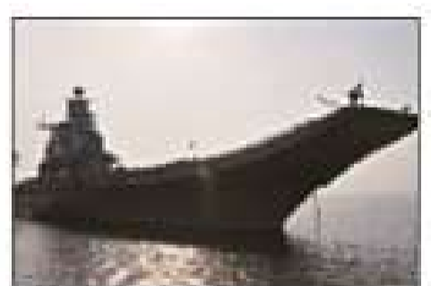
INS Vikramaditya was entering Karwar harbour