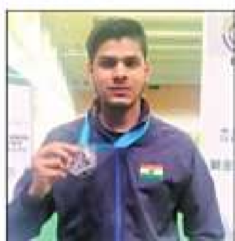
He won the 10m air rifle silver

Pistol World Cup Friday, the 16-year-old from Jaipur did not need PUBG's virtual arsenal, his standard Walther was good enough to fetch him the silver medal behind Chinese Hui Zicheng and more crucially, get India a spot in the 10m air rifle for the Tokyo 2020 Olympics.