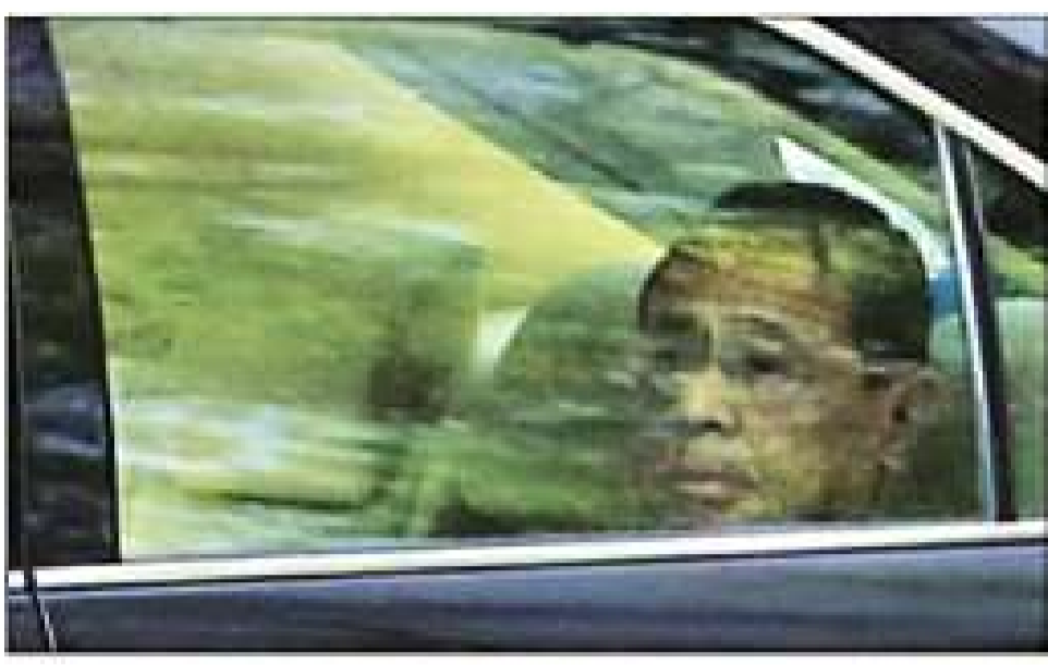
Chief Justice of India Ranjan Gogoi arrives at the Supreme Court on Friday.