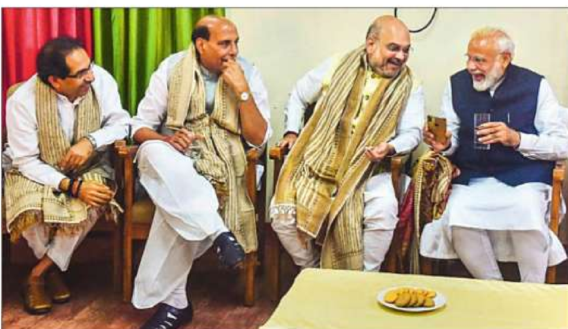
Prime Minister Modi with Amit Shah, Rajnath Singh and Uddhav Thackeray in Varanasi, Friday.