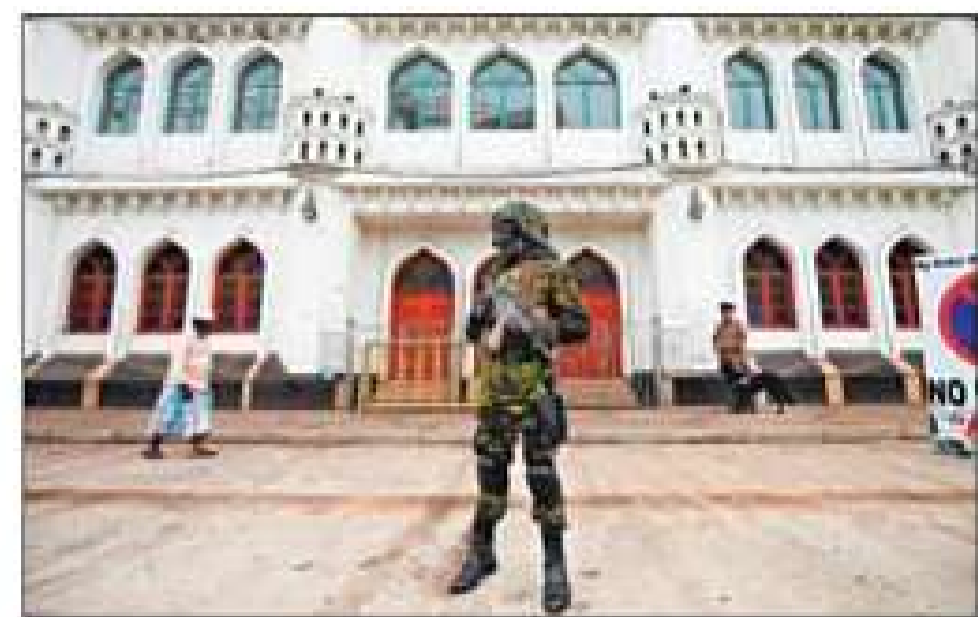
Lankan soldiers guard a mosque in Colombo, Friday.

PLEA IN DELHI HC TO GAG THE PRESS PAGE 8