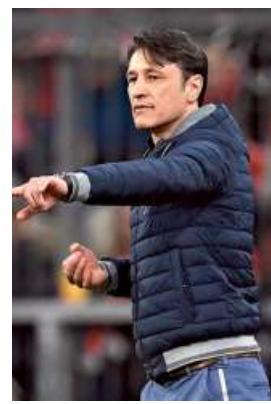
Niko Kovac.

"In October and November, we tripped ourselves up because the coach decided to rotate an unbelievable amount and that led to unrest in the team," said Rummenigge, laying the blame squarely on Kovac for a run of form which saw Bayern win just two