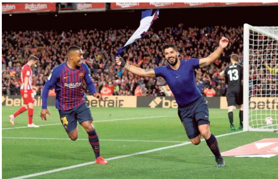
A peach: Luis Suarez can't hide his joy after lining up a shot from 25 yards to score Barcelona's first goal in the 85th minute.

Costa's early and needless dismissal left Atletico needing snookers just to avoid defeat, let alone pull off the win that its coach Diego Simeone had said last week was the only result to keep its chal-