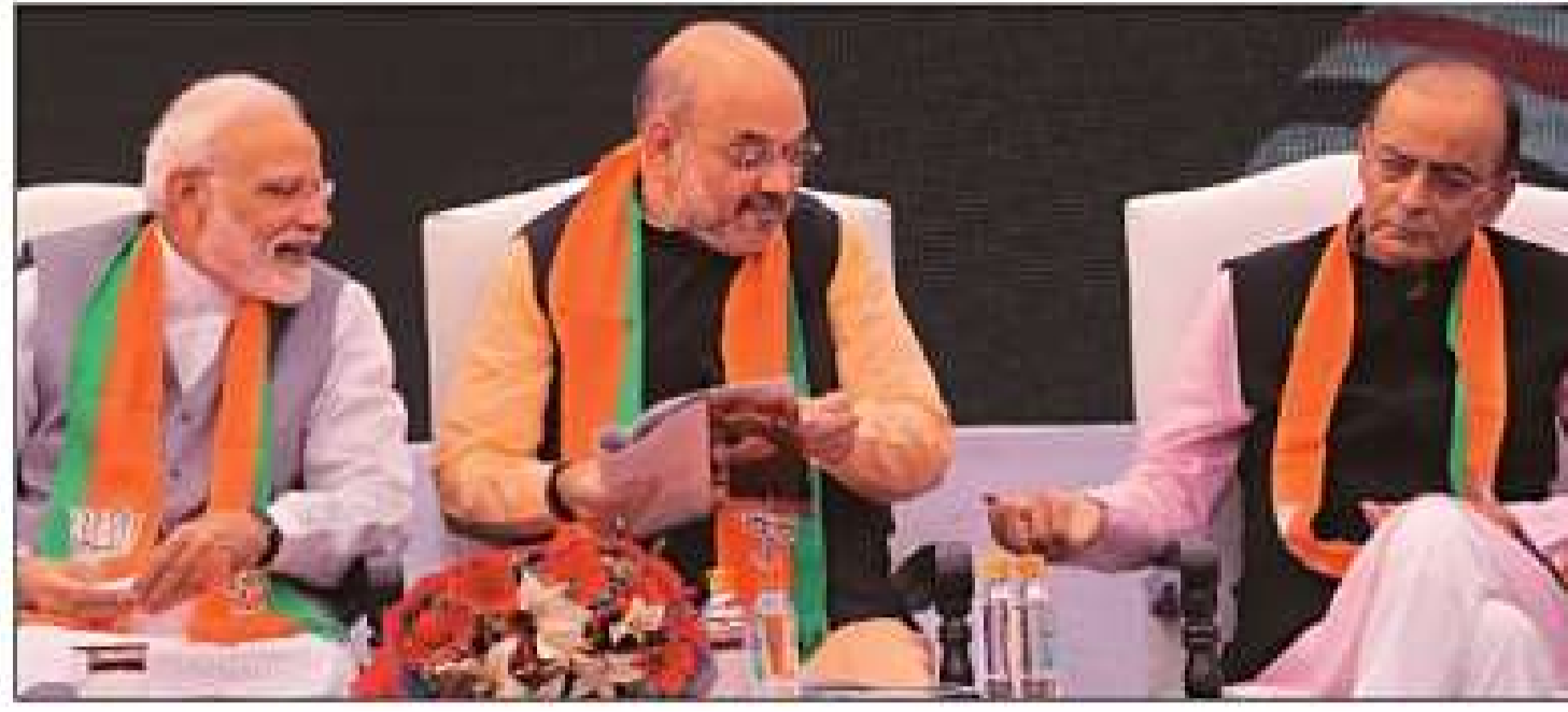
Prime Minister Narendra Modi, BJP chief Amit Shah and Finance Minister Arun Jaitley at the release of the BJP manifesto in New Delhi, Monday. MORE REPORTS PAGE 8