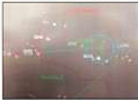
The F-16 track (top) goes missing (below).

ing shared in the public domain." The IAF statement comes days after a report in the Foreign Policy magazine cited US government officials saying that