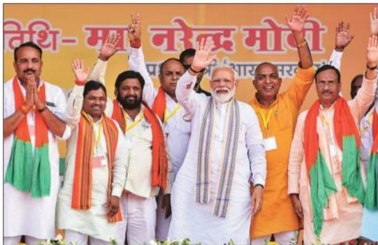
Prime Minister Narendra Modi with UP Deputy Chief Minister Dinesh Sharma and other BJP leaders at a rally in Barabanki district, on Tuesday.

"Abhi apko mandiron mein, bazaaron mein, railway station par, bus station par bam dhamake ki khabrein nahi sunayi deti. Yeh dhamake bandh huay ki nahi huay? Yeh Modi ke dar ke karan bandh hua hai (Do you hear