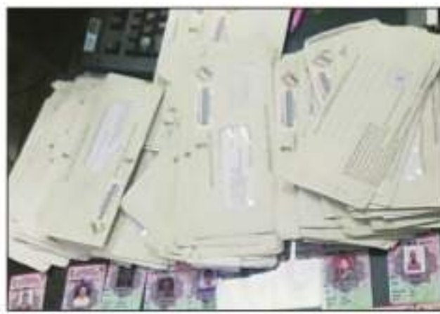
Around 150 cards were allegedly found dumped in Badarpur

The Delhi CEO was subsequently asked by the Commission to conduct an inquiry.