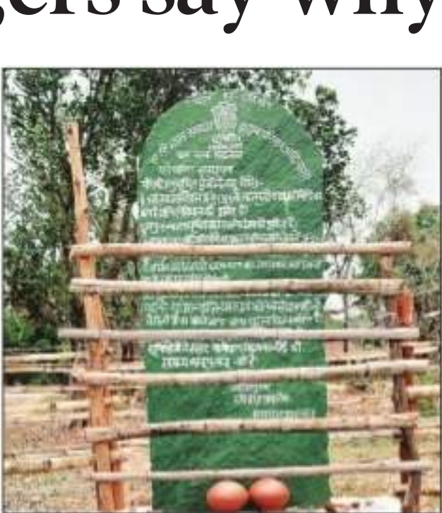
A stone plaque outside Haradlama village in Khunti.