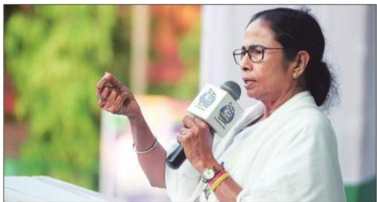
Mamata Banerjee at a rally in Howrah on Tuesday.

Transparency in government jobs, unemployment allowance to the youth, online transfer policy, transparency in change of land-use policies, single-window system, etc are schemes important for us. The people ensured the BJP's victory in successive elections as a result of all these policies.