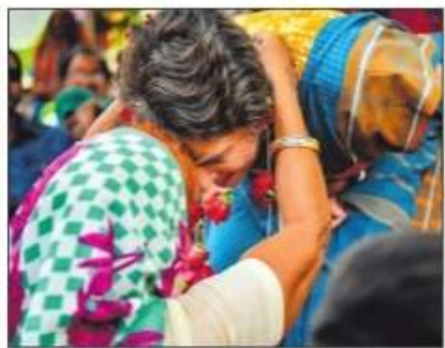
Priyanka Gandhi Vadra interacts with people in Amethi on Tuesday.