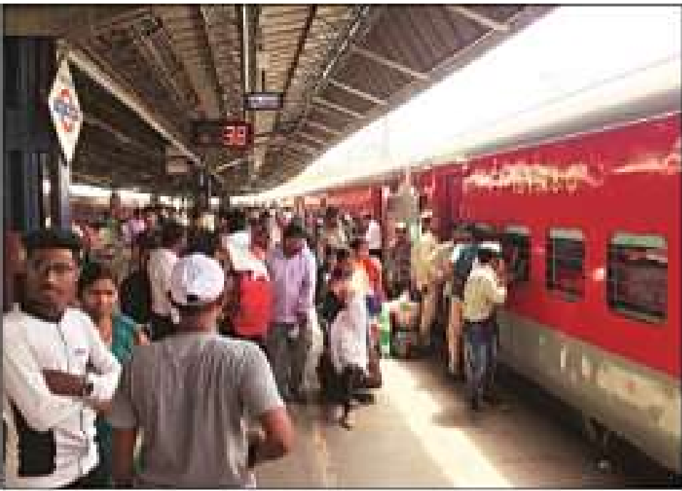
Most commuters took trains to Uttar Pradesh and Bihar

Passengers travelling with families were seen quarrelling with ticket checkers after they could not get a seat. The problem seemed to be more acute in general compartments, where women and children were pushing and elbowing their way