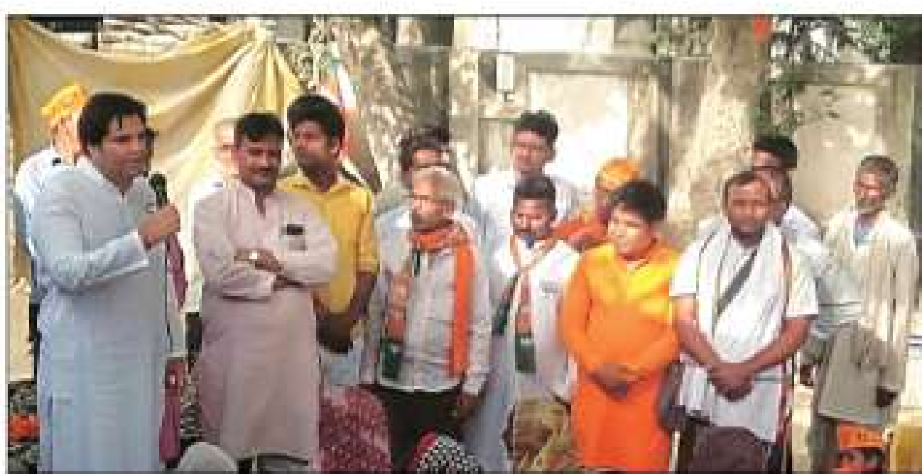
Sitting MP Varun Gandhi campaigns for mother Maneka in Sultanpur.