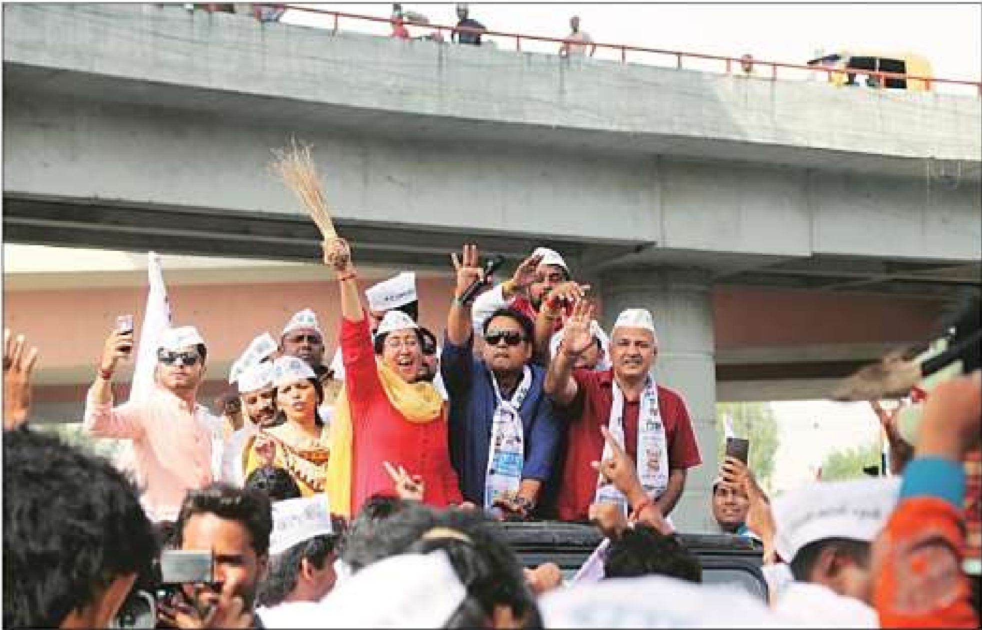
AAP's East Delhi candidate Atishi and Deputy CM Manish Sisodia at a road show on the last day of campaigning, Friday. The capital votes on May 12.