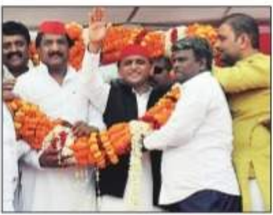
Akhilesh Yadav in Gorakhpur on Saturday.