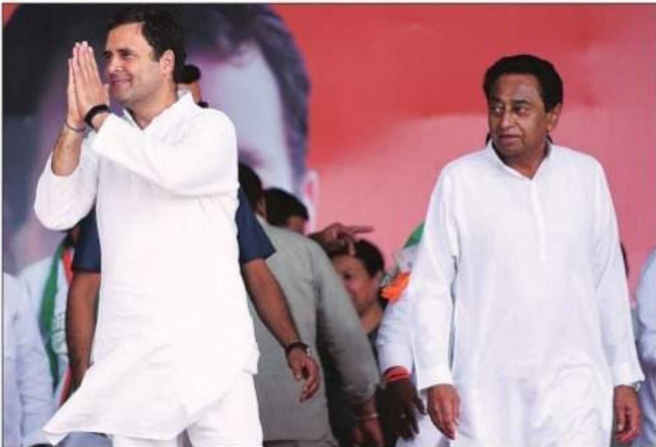
Congress president Rahul Gandhi with Madhya Pradesh Chief Minister Kamal Nath at a rally in Dhar district on Saturday.

At Khargone, Rahul took jibes at Modi over the perception that he sleeps only three hours a day. “He kept awake for 21 hours but could not answer my questions on Rafale deal in Parliament,” he said, adding that Modi