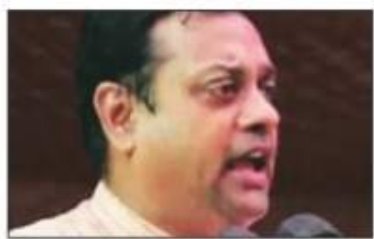
BJP spokesperson Sambit Patra