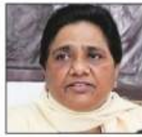
Mayawati: Cong 'hid' the incident

She also claimed that "members of some parties" are forcing some women to make "fake allegations of rape" in what they claim are old cases. "This is disgusting. Even in such cases, my party wants the Supreme Court to take suo motu cognizance so that no politi-