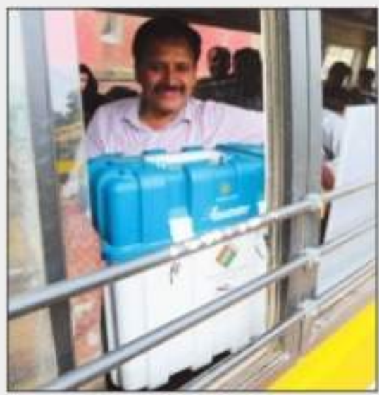
Polling officials with EVMs on the eve of elections, in Panchkula.