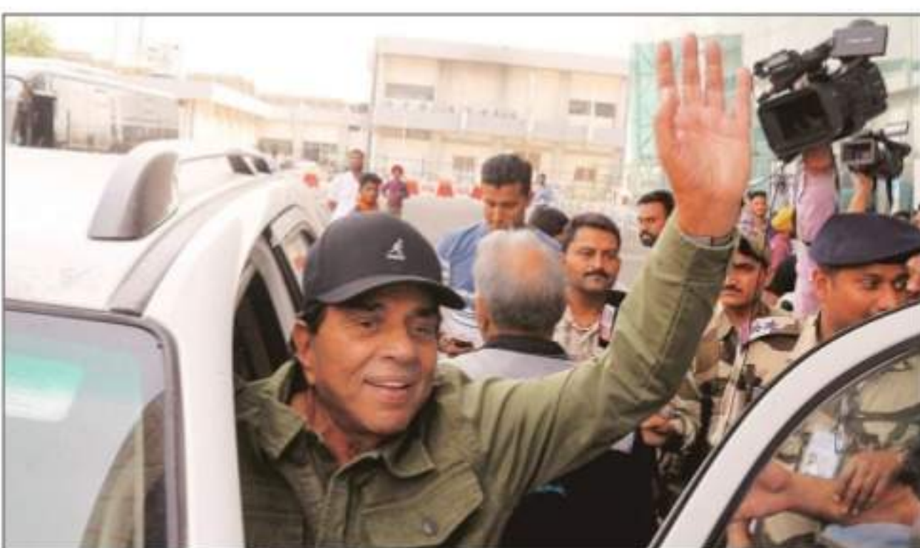
Actor Dharmendra at the Amritsar airport on Friday.

Dharmendra, whose wife Hema Malini is the sitting BJP MP from Mathura in Uttar Pradesh and is seeking re-election, said his is not a family of politicians. “We are not politicians. There is politics in the film indus-