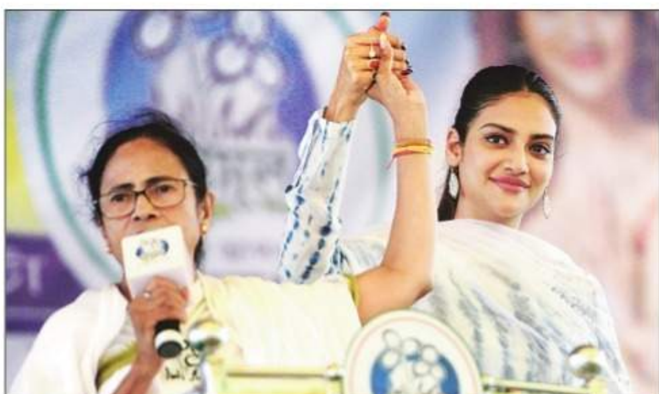
Mamata Banerjee with TMC’s Basirhat candidate Nusrat Jahan on Saturday.

A case was subsequently registered at Falta police station under IPC Section 354 (assault or criminal force with intent to outrage modesty of woman) and under POCSO Act.