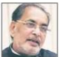
Radha Mohan Singh