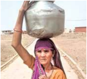
A woman carries water in Nayapura, Ghatigaon in Gwalior.

Like him, the village is home to members of the Sahariya tribe, one among the 75 tribes declared Particularly Vulnerable Tribal Groups by the Ministry of Home Affairs. Over the years, the tribe has faced issues of malnutrition and stunting among chil-