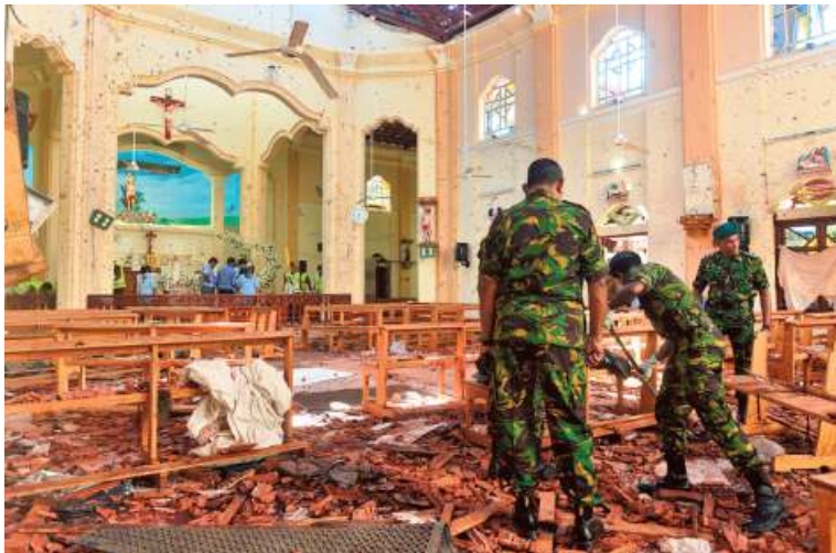
"The attacks in Sri Lanka underline the many cracks in the concept of a global War on Terror." Security personnel inspect the interior of St. Sebastian's Church in Negombo, Sri Lanka, on April 22, a day after the Easter Sunday blasts.

The war in Afghanistan was only one of the many coalitions the U.S. led in the name of the War on Terror: 46 nations joined the 'coalition of the willing' to defeat Saddam Hussein in Iraq in 2003, and 19 were a part of the coalition that ousted Muammar Qaddafi from power in Libya in 2011. The U.S. and allied countries were sidetracked by the 'Arab Spring' in 2011, which led them to bolster anti-Bashar al-Assad groups in Syria. This eventually paved the way for the IS to establish a 'Caliphate' in territories in Syria and Iraq. The next coalition was formed to fight the terror of the