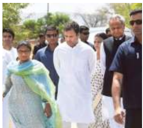
Rahul Gandhi with Rajasthan CM Ashok Gehlot (right) and party MP Sushmita Dev at Alwar in Rajasthan on Thursday.

SPECIAL CORRESPONDENT JAIPUR Congress president Rahul Gandhi on Thursday vowed to ensure that culprits in the alleged gang rape of a Dalit woman at Thanagazi in Rajasthan's Alwar district were swiftly brought to justice. He gave this assurance to the victim and her family when he met them, after having flown in directly from New Delhi by helicopter. "As soon as I heard about the incident, I called [Rajasthan Chief Minister] Ashok Gehlotji," Mr. Gandhi told reporters after meeting the fa-