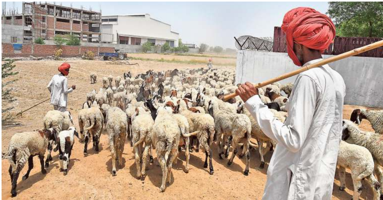
Shepherds take their sheep for grazing on a hot afternoon in Palwal on Thursday.