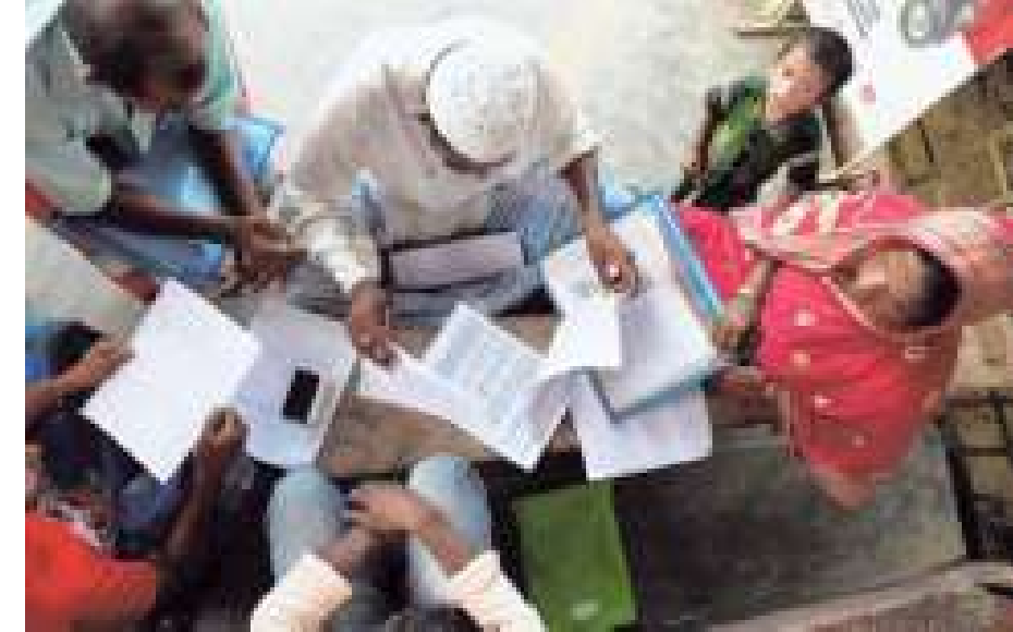
Identity crisis: A man helps villagers in filing NRC forms in Mayong village in Morigaon district of Assam in this picture from August 2018.