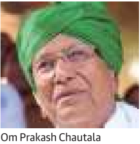
Om Prakash Chautala

Mr. Chautala and others for allegedly acquiring assets disproportionate to their known sources of income. The CBI has filed a chargesheet against him and his sons, Abhay and Ajay Chautala, under the Prevention of Corruption Act. According to the CBI, Mr. Chautala had acquired assets disproportionate to his known sources of income to the tune of ₹6.09 crore from May 24, 1993, to May 31,