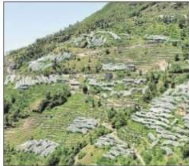
Apple orchards in Upper Shimla region covered in anti-hail nets.