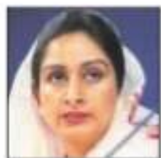
Harsimrat Kaur Badal