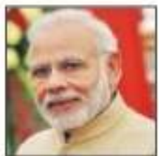
PM Narendra Modi