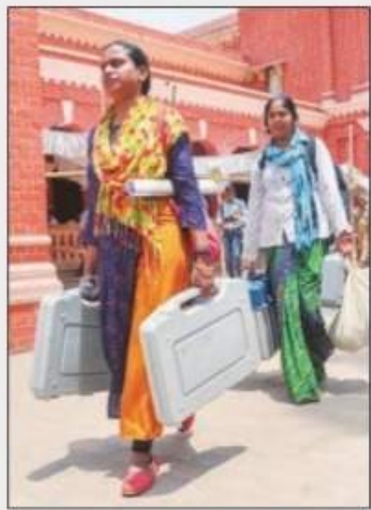
Polling officials leave for polling booths from a distribution centre in Varanasi Saturday.