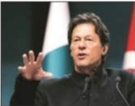
‘Look forward to working with Prime Minister Modi’