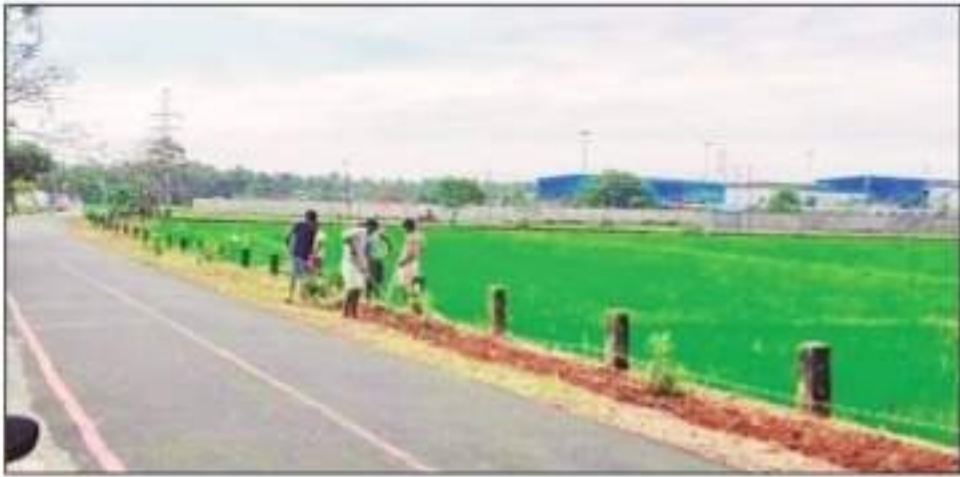
The reclaimed land in Aluva.

Guided by Kerala’s agriculture department and scientists, they toiled for three years to convert nearly 50 acres of stinking garbage land that had eaten up the fading paddy fields of Choomnikkara in Aluva into the lush green home of a