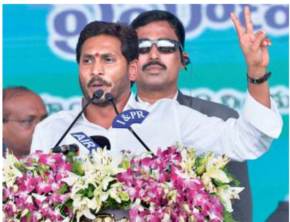
Laying out priorities: Y.S. Jagan Mohan Reddy speaking after he was sworn in on Thursday.

CELEBRITIES, HONCHOS, STARS STEAL THE SHOW • PAGE 13 THANKS MODI • PAGE 13