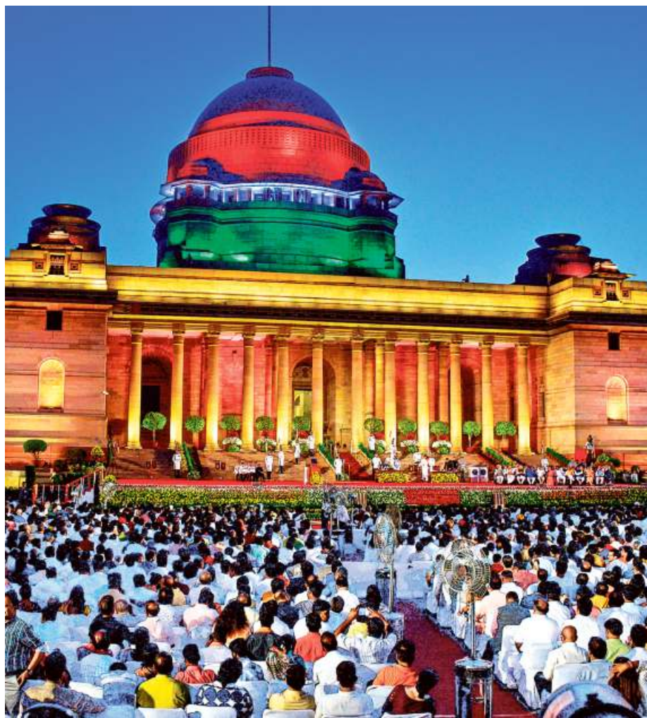
Perfect backdrop: Around 8,000 guests attended the swearing-in ceremony of Prime Minister Narendra Modi at Rashtrapati Bhavan in New Delhi on Thursday.

S. JAISHANKAR, A POLICY WOKN AMONG POLITICIANS • PAGE 13