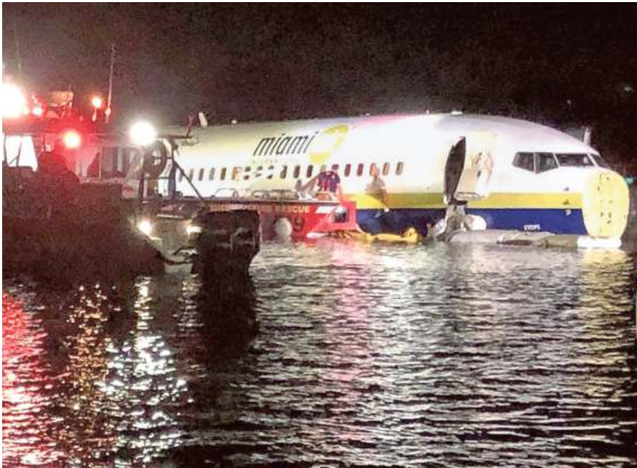
Slippery landing: A Boeing 737 skidded off the runway into a river after crash-landing during a storm in Florida on Friday. The plane from Guantanamo Bay in Cuba slammed into shallow water next to a naval air station in Jacksonville. (REPORT ON PAGE 12)