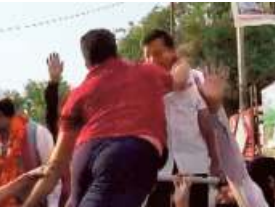
A video grab of a man slapping Arvind Kejriwal on Saturday.

Mr. Kejriwal's roadshow continued even after the attack and passed through Patel Chowk and Karol Bagh among other areas. AAP blamed the BJP for the attack and said that the Prime Minister and BJP president