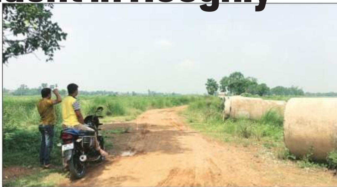
Concrete pipes at what was earlier the Tata factory site in Singur. Ravik Bhattacharya