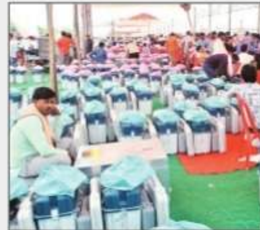
EVM distribution ahead of polling for the fifth phase, in Lucknow on Sunday. Vishal Srivastav

JAMMU AND KASHMIR: 2 of 6 LS seats (2014: PDP 1, BJP 1) The districts of Pulwama and Shopian in the Anantnag constituency go to polls in the fifth phase. Owing to militancy, the government's focus is on peaceful polling than on ensuring a high turnout. In Ladakh, it is not only a contest between four candidates but also between two districts — the Buddhist-dominated Leh and the Muslim-dominated Kargil. Apart from candidates of BJP and Congress, two Independents are in fray.