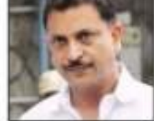
RAJIV PRATAP RUDY