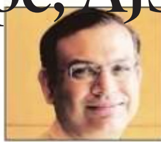
Union Minister Jayant Sinha