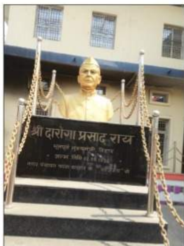
A brass bust of former CM Daroga Prasad Rai at Parsa Bazar.