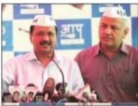
Arvind Kejriwal, Manish Sisodia Sunday.

Addressing a press conference at the AAP headquarters,