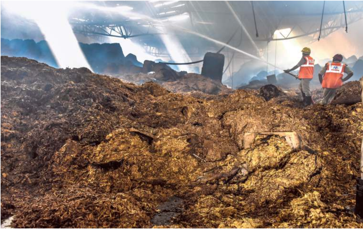
Firemen dousing flames at a tobacco godown on the outskirts of Guntur in Andhra Pradesh on Monday. Hundreds of tobacco bales were destroyed in the blaze that was put out after a seven-hour effort.