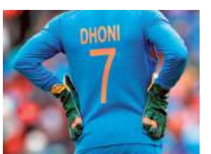
M.S. Dhoni.

M.S. Dhoni took the field without a controversial dagger logo on his wicketkeeping gloves in Sunday's World Cup game against Australia after being ordered to remove the symbol by the ICC. Dhoni's gloves in the opening game against South Africa bore an apparent military insignia that breached rules laid down by the ICC.