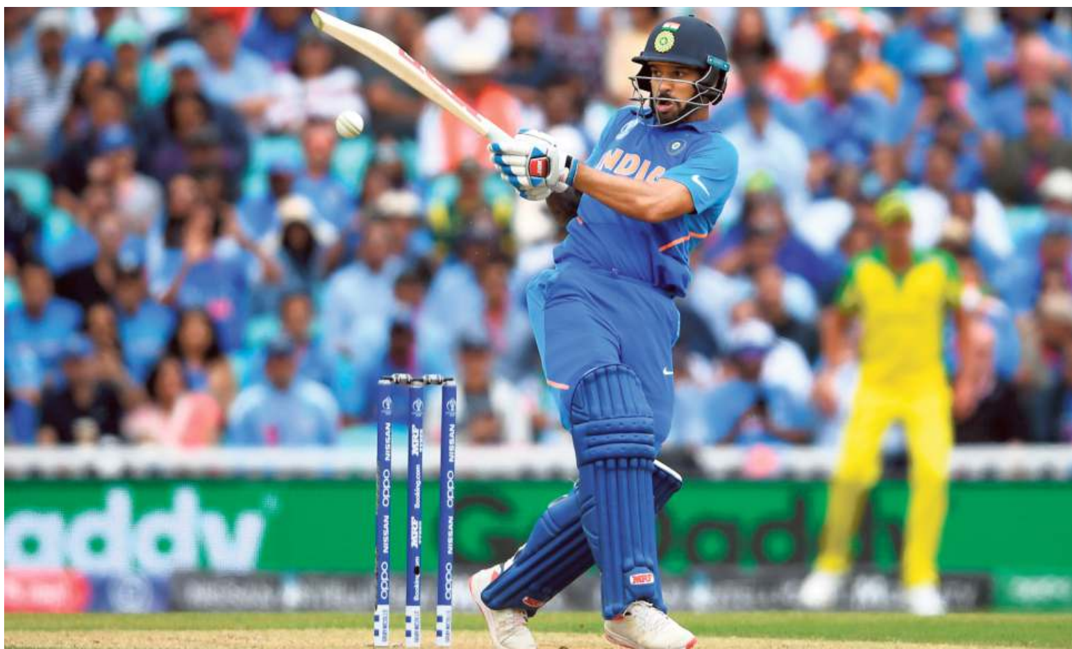
Stepping up: Shikhar Dhawan scored his third World Cup century, and sixth in ICC events.

Glenn Maxwell then flung his bat around, but with Bhuvneshwar delivering a double blow in the 40th over to dismiss Smith and Marcus