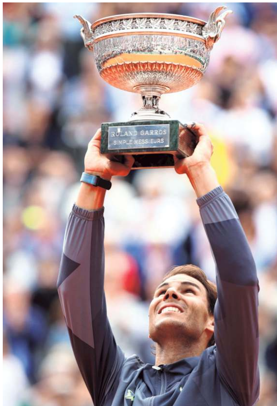
Top of the heap: Rafael Nadal underlined his supremacy at the French Open yet again.

But the 25-year-old's joy was short-lived as Nadal retrieved the break in the sixth game before racing away