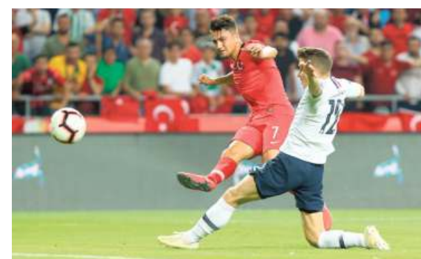
The clincher: Cengiz Under fires in Turkey's second goal against France.

The results: Group C: Estonia 1 (Vassiljev 25) lost to Northern Ireland 2 (Washington 77, Magennis 80);