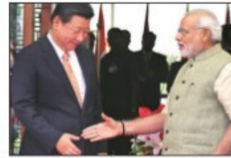
They will meet on sidelines of SCO summit. File

WITH A meeting between Prime Minister Narendra Modi and Chinese President Xi Jinping scheduled on the sidelines of the Shanghai Cooperation Organisation summit this week, China Monday hoped that the two leaders would discuss their respective trade frictions with the US and the two "good friends" could reach a consensus on opposing "trade protectionism".