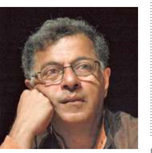
Rakshasa Tangadi , published last year, set in the last years of the Vijayanagara empire.

Mr. Karnad also translated most of his plays into English. His last play was