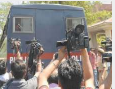
The accused being taken away in a police vehicle in Pathankot on Monday.