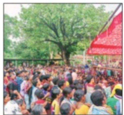
Tribals protest in Kirandul against iron ore mining in a hill they call their god

At the NMDC Ltd complex in Kirandul, the site of the protest, thousands of adivasis from Dantewada, Sukma and Bijapur districts have gathered over the