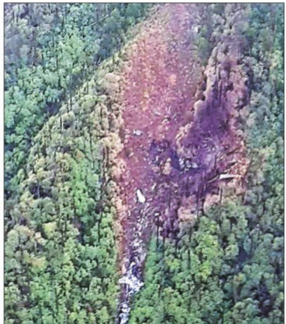
The wreckage of the IAF An-32 on an Arunachal hillside.