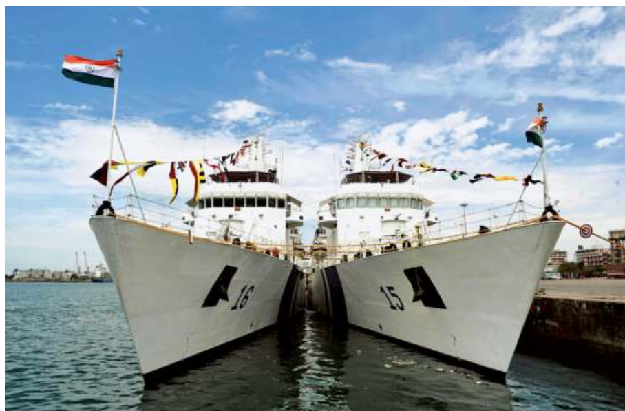
A ceremony was held at Chennai port on Tuesday to seal affiliation ties between the Coast Guard and the 3rd (Naga Hills) battalion of Assam Rifles on ICGS Shaurya, left. A battalion of the Assam Rifles will train on the ship.