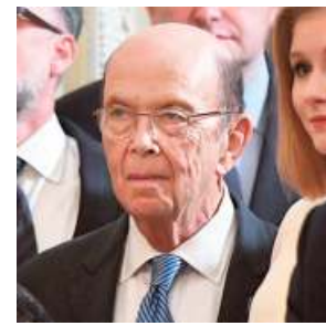
U.S. Commerce Secretary Wilbur Ross.

India's eligibility for the GSP programme was withdrawn earlier this month because, as per President Donald Trump, India had not provided adequate assurances