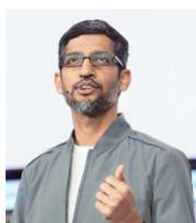
Google chief Sundar Pichai.

made during a U.S.-India Business Council's (USIBC) India Ideas Summit in Washington. Mr. Pichai was there to receive a Global Leadership Award from USIBC. Nasdaq President and CEO Adena Friedman was also an award recipient.