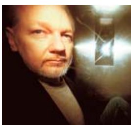
Julian Assange.

The final decision on whether Mr. Assange can be extradited will rest with the