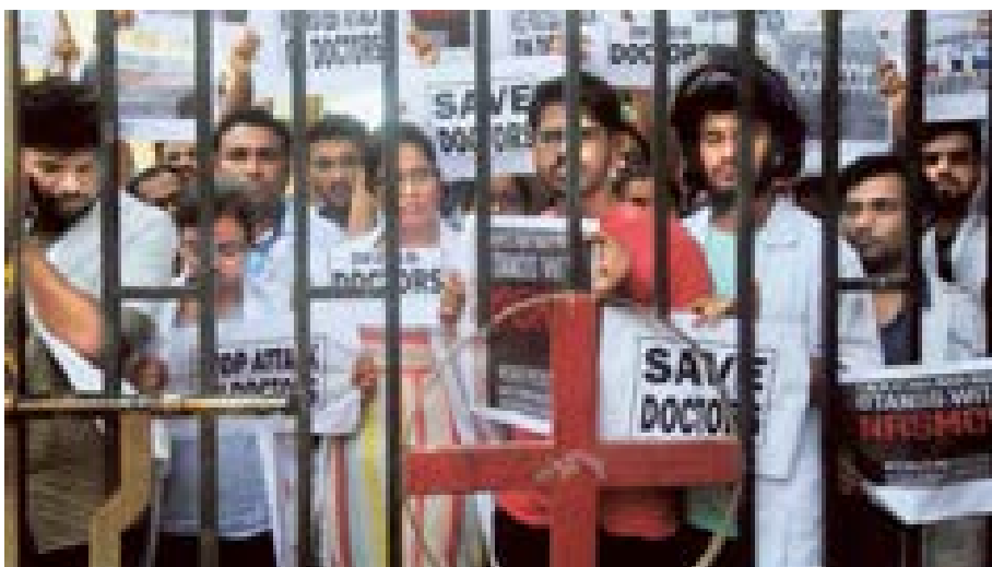
Up in arms: A protest at Nair Hospital in Mumbai against the attack on doctors at a hospital in West Bengal.

HARSH VARDHAN ASKS DOCTORS TO CALL OFF PROTESTS PAGE 12 CRISIS DEEPENS PAGE 12 SEE ALSO PAGE 4