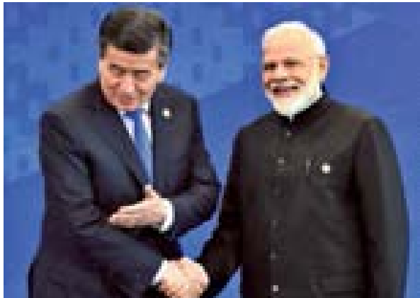
Warm reception: Kyrgyz President Sooronbai Jeenbekov greets PM Modi before a meeting of the SCO Council of Heads of State in Bishkek on Friday.

Friday's exchange, though brief, is the first since the Pulwama terror attack, which led to a dramatic escalation of tensions.