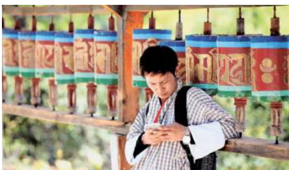
Shangri-La worried: Bhutan promoted a brand of tourism that brought in only a few willing to pay well.

The crowds have sparked a major debate across the country that could mean tougher regulations for tourists from the region, especially India.