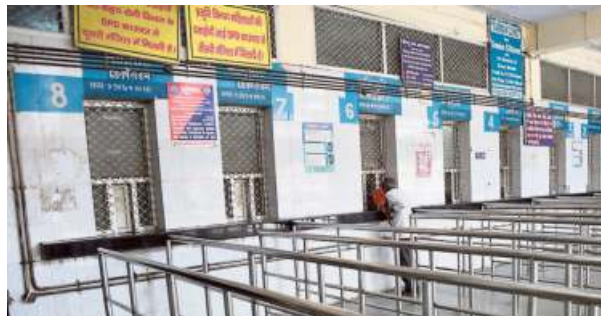
An empty OPD counter at Hindu Rao Hospital here on Saturday (left); a doctor wearing a helmet as a mark of protest treats a patient at AIIMS.

Doctors at the All India Institute of Medical Sciences (AIIMS) and other hospitals, including Safdarjung, Ram Manohar Lohia, Sanjay Gandhi, ESIC (Basaidarapur) and Chaha Nehru participat-