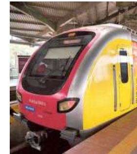
The company booked impairment and write-offs worth ₹8,500 crore.

Reliance Power reported a loss of ₹3,558.5 crore for