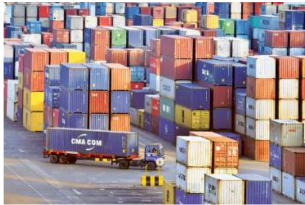
Tit for tat: India had said it would impose tariffs on 29 goods from June 16. ■ K.R. DEEPAK

A 301 probe can be wide in scope and can result in the