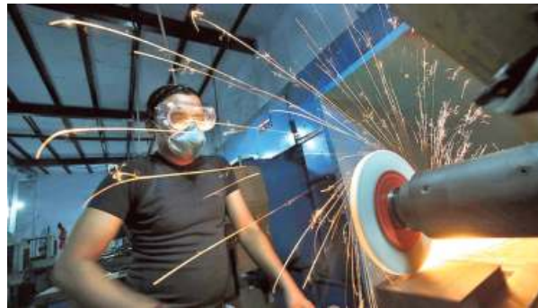
Way forward: If labour rules are simplified, the country will experience a boom in formal employment, says ISF.

In August last year, Holitech Technology signed an MoU to set up a production