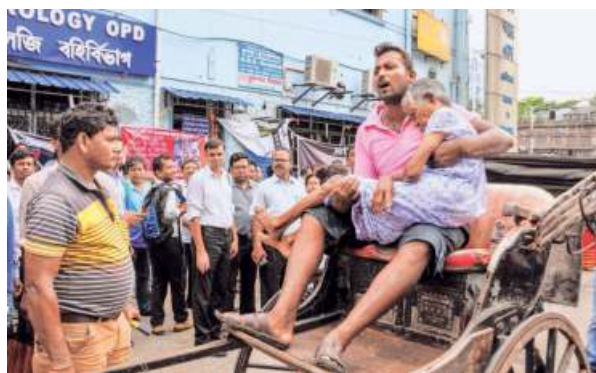
Seeking succour: A patient being brought for treatment during the strike at a hospital in Kolkata on Saturday.

"This Ministry is in receipt of a number of representations from doctors and medical associations from different parts of country for their security in view of the ongoing strike by doctors in West Bengal. It is requested that a detailed report be sent urgently on the ongoing strike by the doctors," it said.