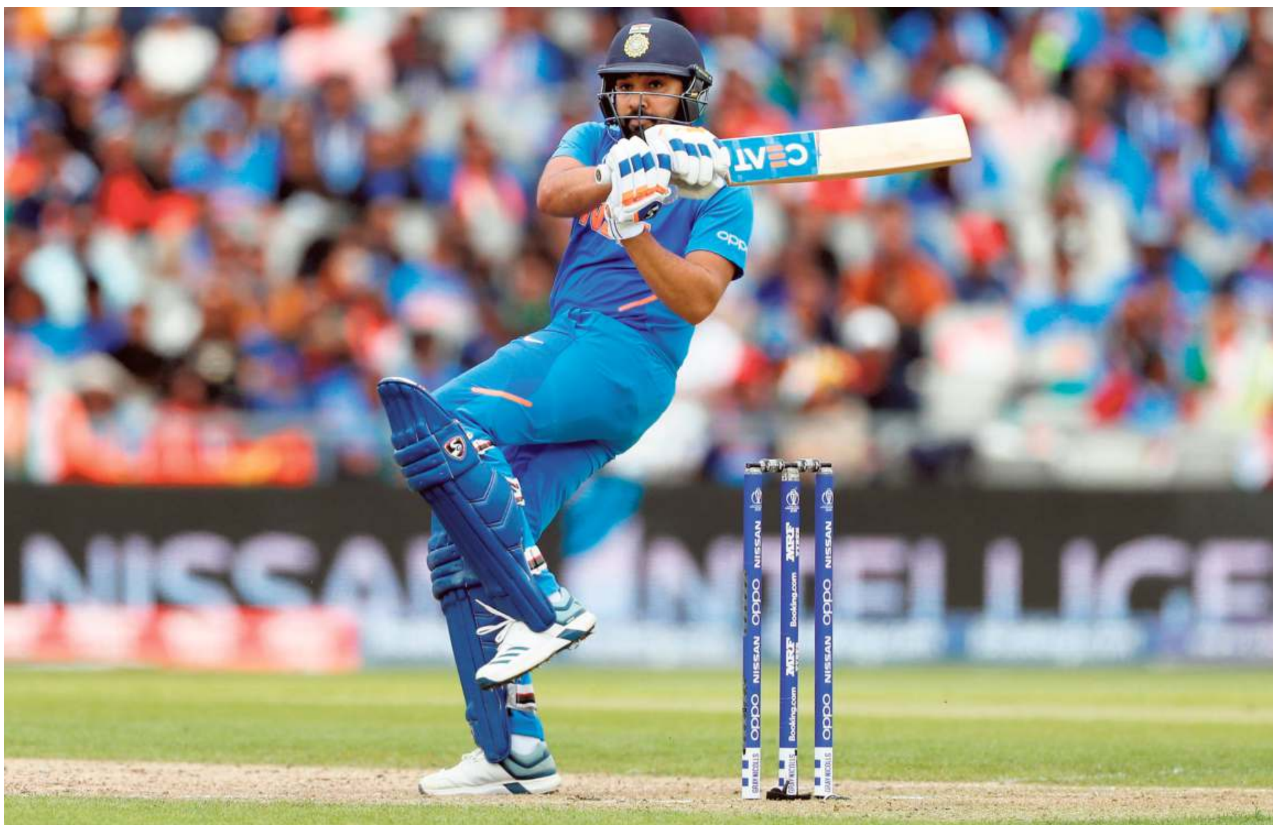
Rocking start: Rohit Sharma made the Pakistan bowlers pay for the wayward length with an assortment of pulls and cuts en route to a big century.

bright, suffered a drizzle and once the droplets paused, Sarfaraz won the toss and elected to field. After the national anthems were played, Kohli put an arm around Rohit and patted K.L. Rahul. The last two named emerged as India's openers. Mohammad Amir commenced the attack and Rahul played out a maiden over.