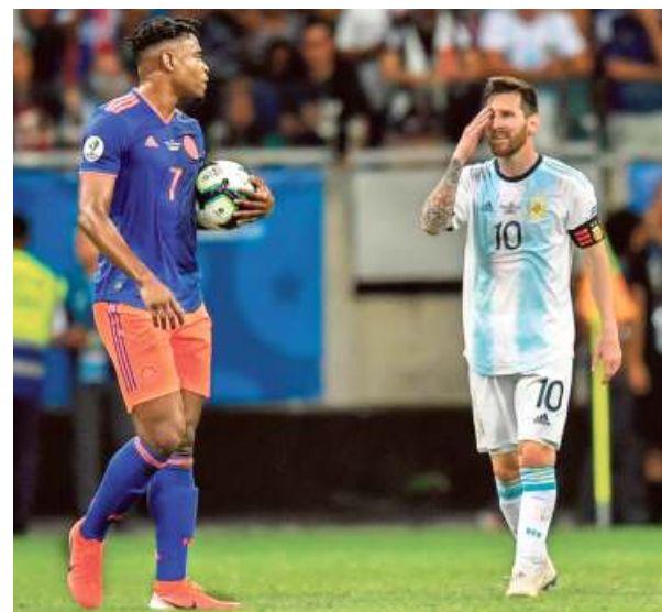
Contrasting emotions: Duван Zapata, who scored Colombia's second, takes the match ball even as Argentina's Lionel Messi looks despondent.

Argentina hasn't won a major tournament in 26 years and was beaten finalists in the last two editions of the South American showpiece, as well as the 2014