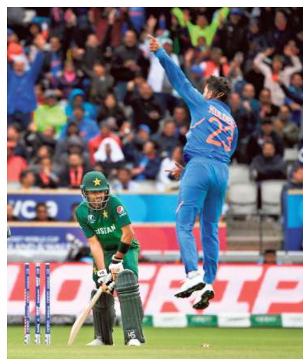
The magician: Kuldeep Yadav is cock-a-hoop after deceiving Babar Azam with a beauty.

*Till the India-Pakistan match on June 16