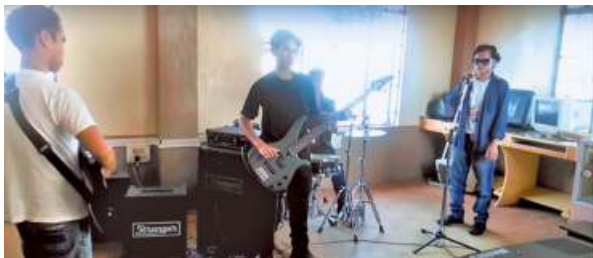
The Light After Dark band during a practice session.

music at the government-run centre here, also maintained that he had to blindfold himself on occasions to get a feel of how the troupe members perceive the musical notes.