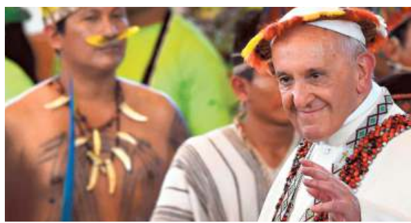
Historic shift: A file photo of Pope Francis with members of indigenous communities of the Amazon basin.

the possibility of ordaining what are known as viri probati - Latin for men of pro-