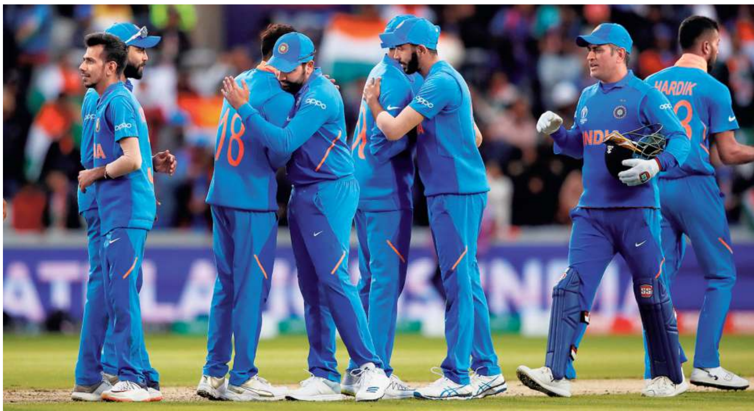
Camaraderie: The Indian team is gelling well and every player is playing a part in the team's victories.

India's triumph over Pakistan here at Old Trafford on Sunday blended the big moments with the small successes. Well-oiled teams get this symmetry right, the players are alive to the situation and every move advances the squad's fortunes. "I cannot single-handedly chase a 300-plus score. Others chip in, partnerships happen and inside the dressing room, we recognise those contributions," Virat Kohli recently said.