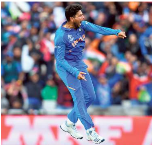
Flying high: Kuldeep Yadav is back in business after a mediocre show in the IPL.

Sunday's adrenaline-sprinkled but rain-marred World Cup clash between India and Pakistan at Old Trafford, had entered a decisive phase. Pursuing 336, Sarfaraz Ahmed's men needed a pivotal partnership and Fakhar Zaman and Babar Azam were precisely doing that, nudging the single, blocking the good deliveries and slamming the loose ones.