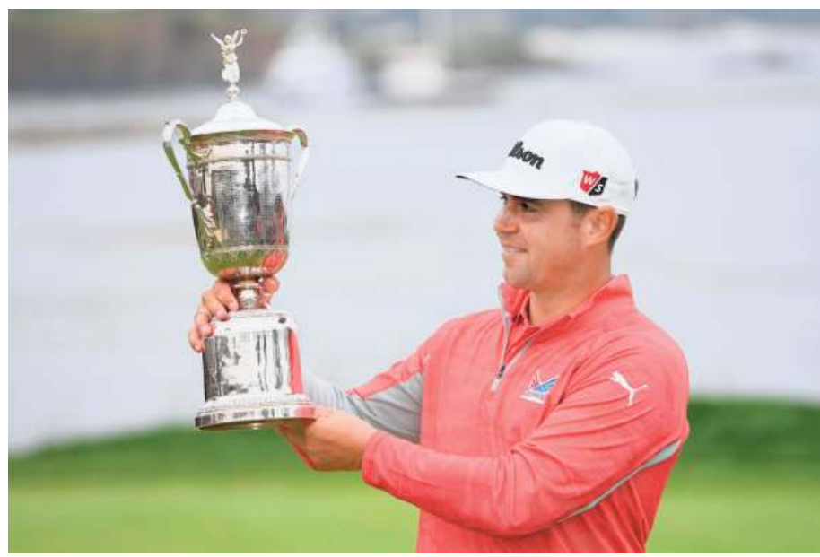
One to cherish: Gary Woodland's display of back-nine fortitude saw him convert a 54-hole lead for the first time in eight career attempts.

He knew his total was one better than the 12-under posted by Tiger Woods in his US Open victory in 2000. But 19 years ago, Woods was the only player under par, marching to victory by a massive 15 strokes while Woodland topped a leader-