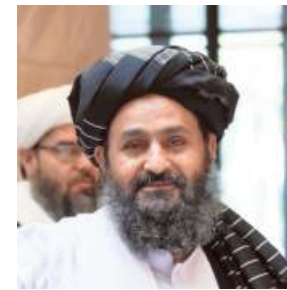
Mullah Abdul Ghani Baradar

Arab News , the daily from Saudi Arabia, had reported on Sunday that Baradar, who heads the Taliban office in Doha, is visiting Beijing for talks with Chinese officials, days ahead of a crucial seventh round of talks in Qatar with U.S. officials. China has