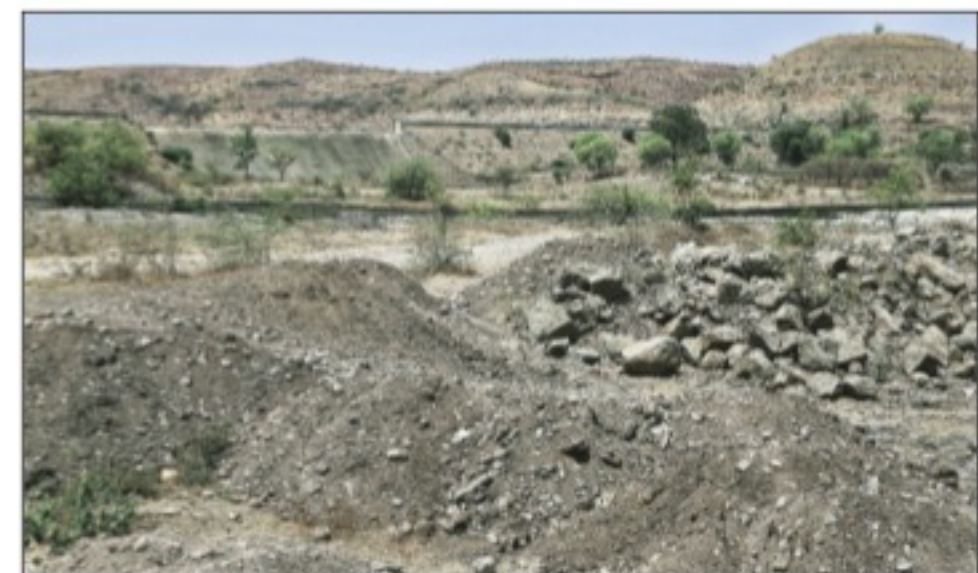
At a dam site in parched Beed in Marathwada. Amit Chakravarty