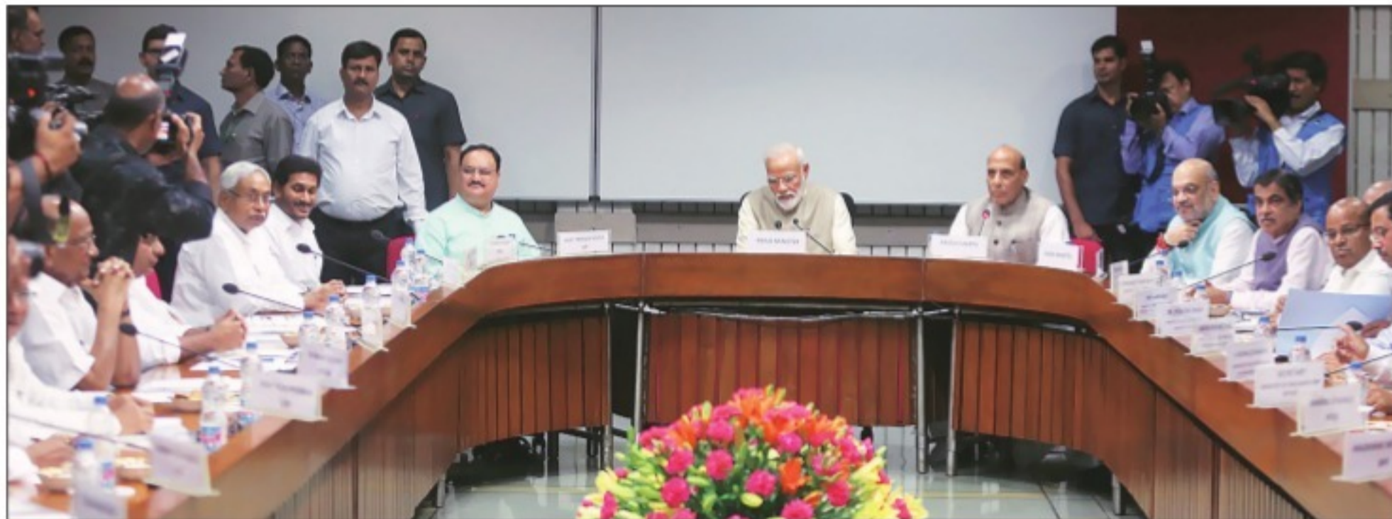
Prime Minister Narendra Modi at the all-party meeting in New Delhi, Wednesday. Renuka Puri