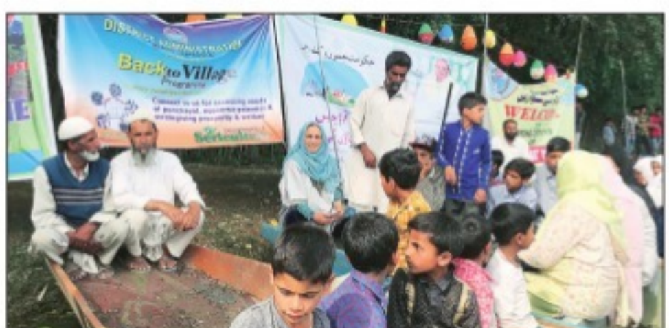
Back to Village awareness programme in Bandipora. Express

At Ground Zero in Muzaffarpur, The Indian Express found that families battling the outbreak are struggling to cope — from a seven-year-old who died en route to a bigger hospital too far away to a father looking for daily-wage work to feed his