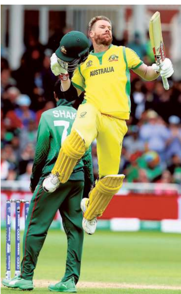
Flying high: David Warner celebrates in inimitable style after notching up his 16th ODI century.

The win took Australia to the top with 10 points.