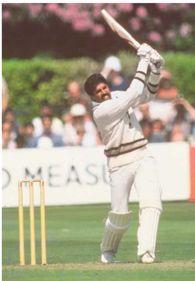
Commanding show: Kapil Dev hits a trademark shot during the epic knock. Right: The great allrounder is lauded by teammates after the scintillating effort.

The 36th anniversary of Kapil's supreme effort passed by just recently and it was time to snuggle into nostalgia's warmth. Strangely, on that epochal day, the BBC