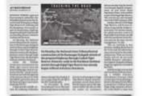
The Indian Express report dated March 14

For promised road, Uttarakhand wangles land from tiger reserve