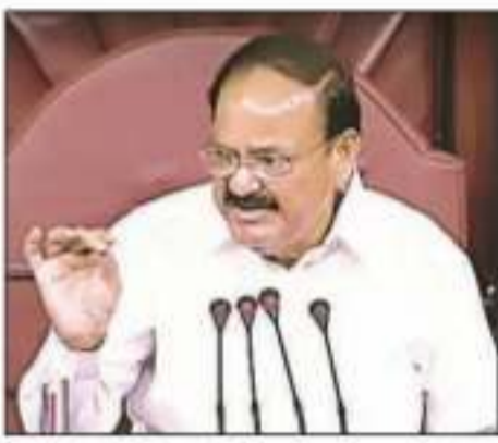
'Three Bills pending for over 20 years, oldest 32 years'

Naidu, who is the chairman of Rajya Sabha, had another suggestion: A Bill which is not taken up for consideration and passage within five years of introduction