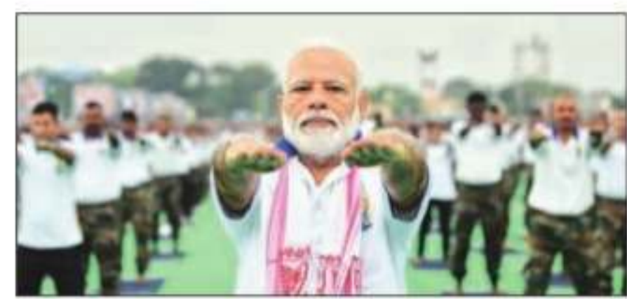
PM LEADS YOGA DAY ACROSS COUNTRY PAGE 8