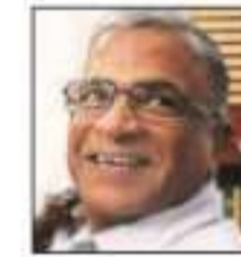
Harivansh heads the RS MPLADS committee

WHILE RAJYA Sabha chairman M Venkaiah Naidu referred to the "wide gap" between the number of Bills passed by the previous Lok Sabha and the Rajya Sabha to express his "concern" and appealed to end the "downside" in the functioning of the Upper House, Deputy Chairman Harivansh is learnt to have red-flagged the problems "plaguing" the "most criticised scheme" of MPLADS with Ministry of