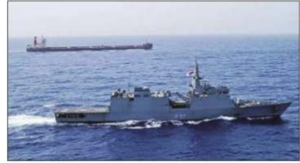
INS Sunayna escorting an oil tanker as part of Operation Sankalp.

On Friday, some of the CONTINUED ON PAGE 2