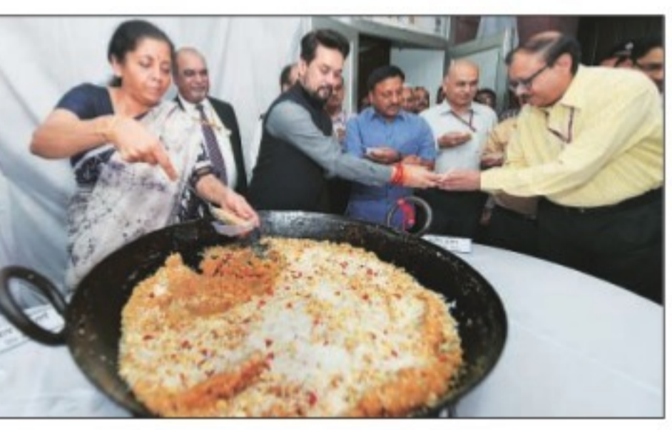
Union Finance Minister Nirmala Sitharaman and Minister of State Anurag Thakur distribute halwa to mark the beginning of printing of budgetary documents on Saturday.

All It Takes is 15 Seconds How TikTok, an app owned by a Chinese firm, has become a playground for India's young