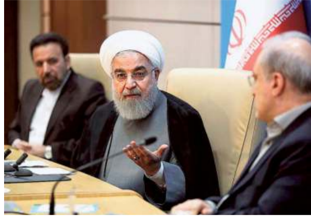
Talking tough: Iran President Hassan Rouhani speaking at a meeting with officials in Tehran on Tuesday.

"Imposing useless sanctions on Iran's Supreme