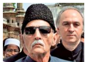
Prince Mukarram Jah — the titular Nizam.

The dispute revolves around £1,007,940 and nine shillings that were transferred in 1948 from the then Nizam of Hyderabad, Osman