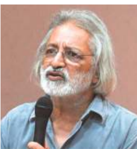
Patwardhan's documentary deals with the rise of ultra-nationalism in the country.

Justice Shaji P. Chaly granted the academy permission, subject to clause 2(i) of the guidelines for the certification of films for festivals.